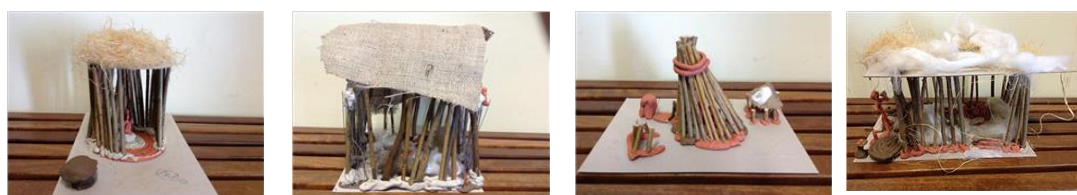
"Creativity takes courage" Henri Matisse